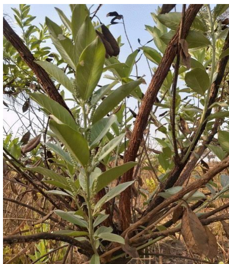
Figure 1: Whole plant of Terminalia albida Scott-Elliot (Picture source IRDPMAG).

Botanical investigations are the gold standard for identifying plant species. Terminalia albida Scott-Elliot is a savannah shrub up to 12 m high, with a twisted bole and open top, with young, leafy, flowering branches covered with dense, silky, silver hairs (Figure 1). The adult leaves are short-stalked (10 to 20 mm) and alternate; their blade is narrow, lanceolate or oblanceolate, with an acuminate tip that is obtuse or pointed, and a more or less rounded base (Lisowski, 2009). The leaves are 7 to 20 cm long and 2 to 4.5 cm wide. The flowers, grouped by two and surrounded by small bracts (4 mm length), are gathered in raceme, axillary, spiciform, velvety, from 5 to 10 cm length. Fruits are mucronate-tipped elliptical samaras, longer than wide (5.5-6.5 cm long and 2-3 cm wide), with a wing arranged around the seed.