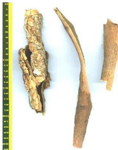
Figure 2: Macroscopic view of the stem bark of T. albida Scott-Elliot (Camara, 2020)

outside, a smooth, very finely wrinkled appearance longitudinally. The inner surface is yellowish brown to orange brown with darker brown spots and is finely striated longitudinally. The light beige break is fibrous.